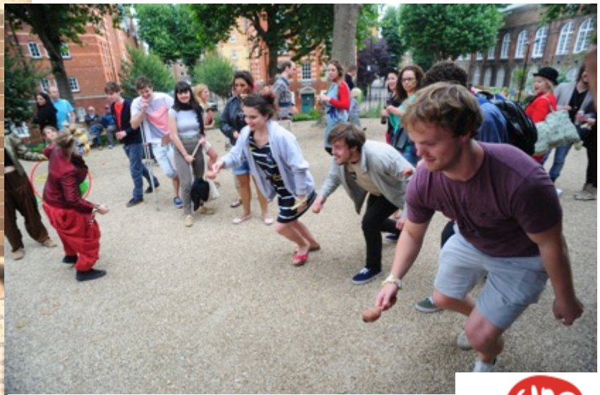
An egg and spoon race