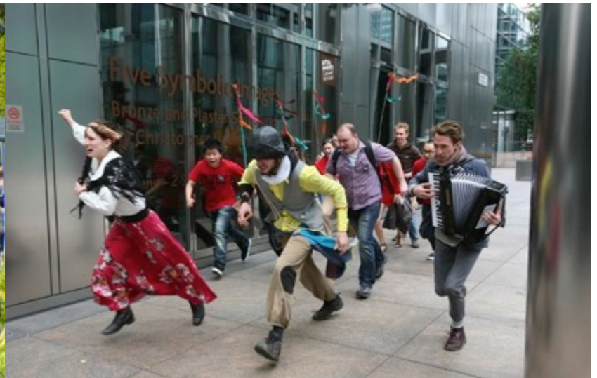
Travelling by foot taxi