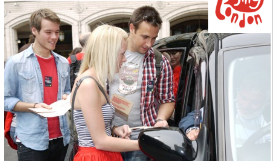
Asking a london cabbie for directions