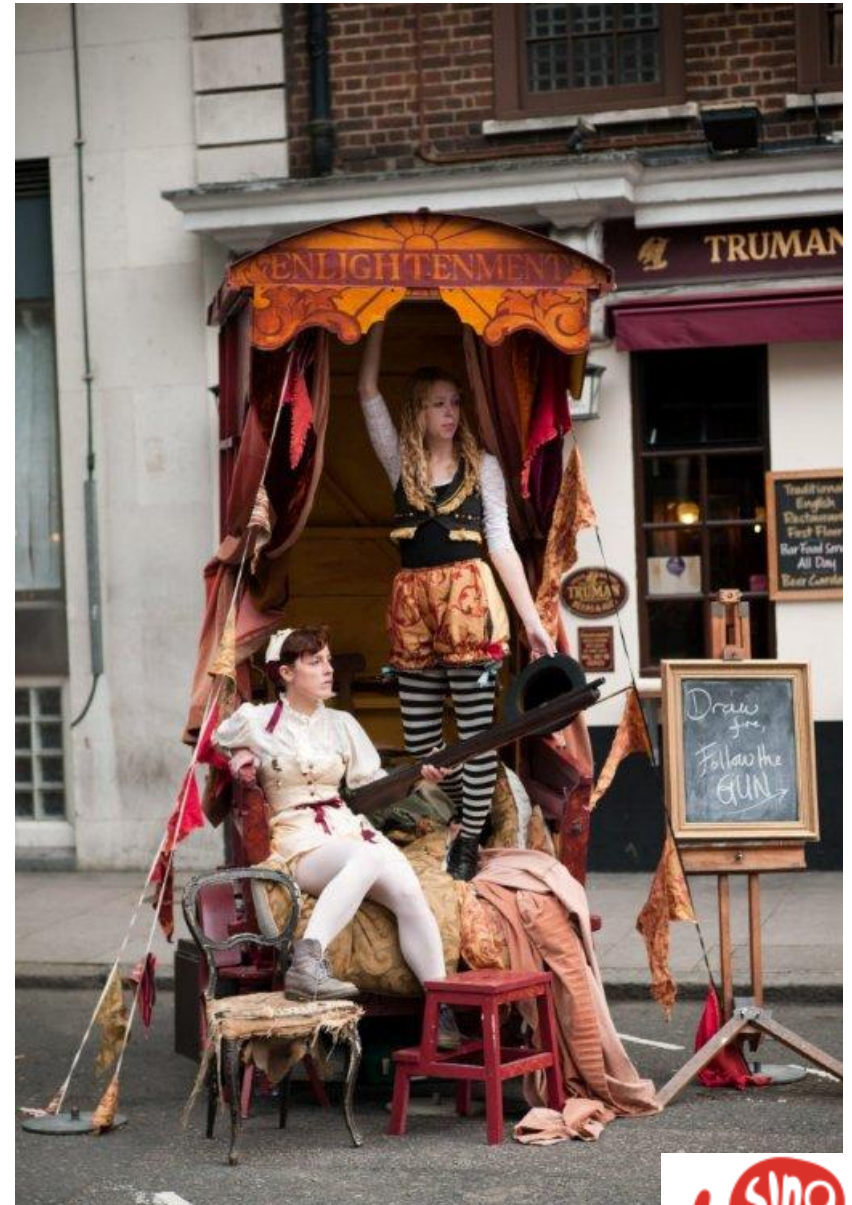
Life drawing on the street