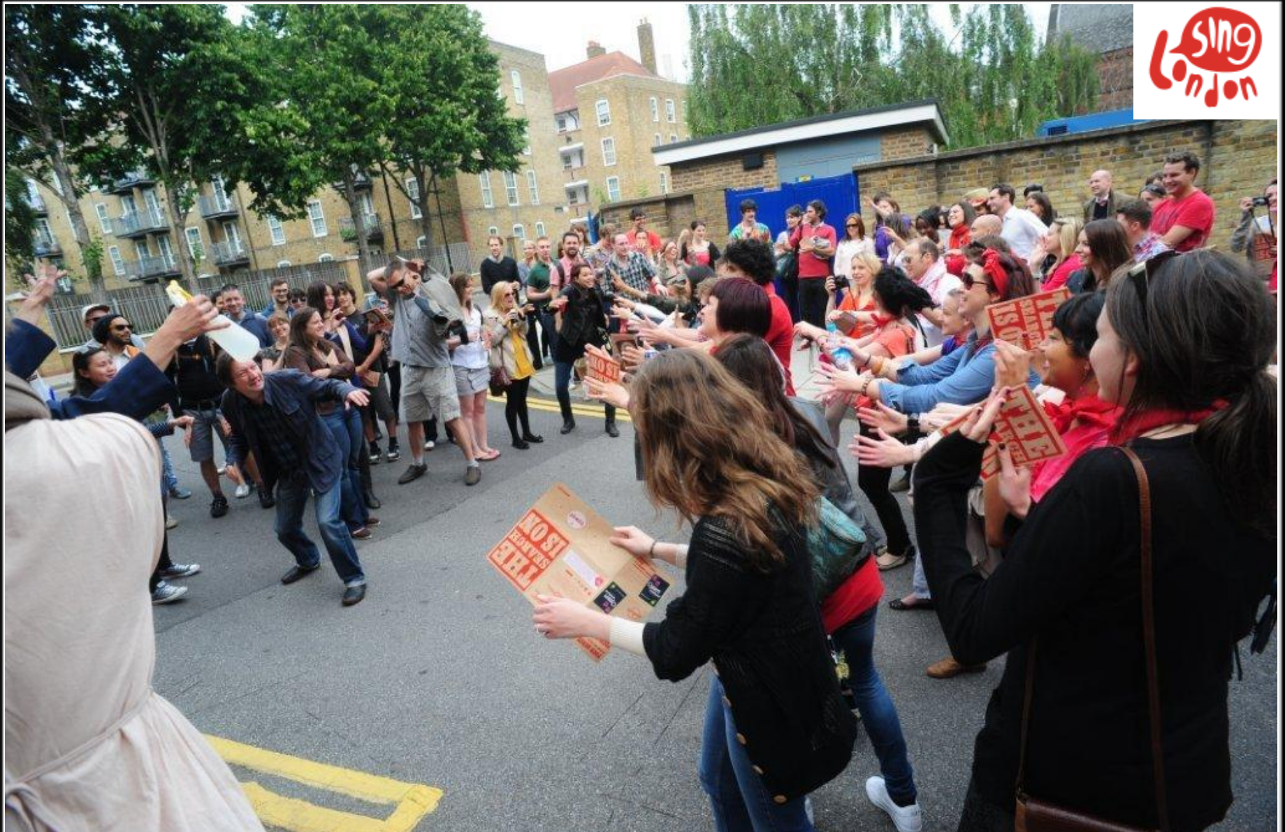
Doing the Hokey Kokey with our specially trained Security Guard