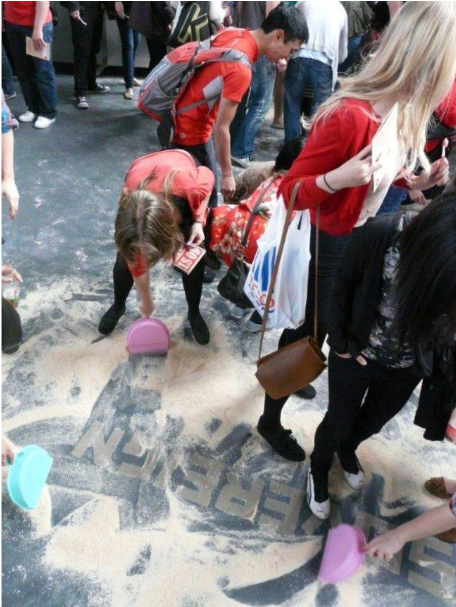
Cleaning the floor of a workhouse