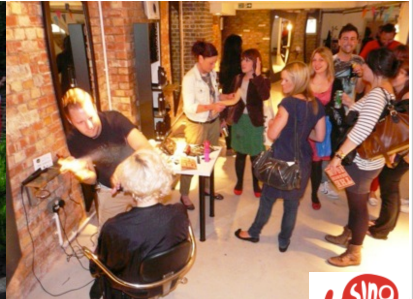
Getting your hair done