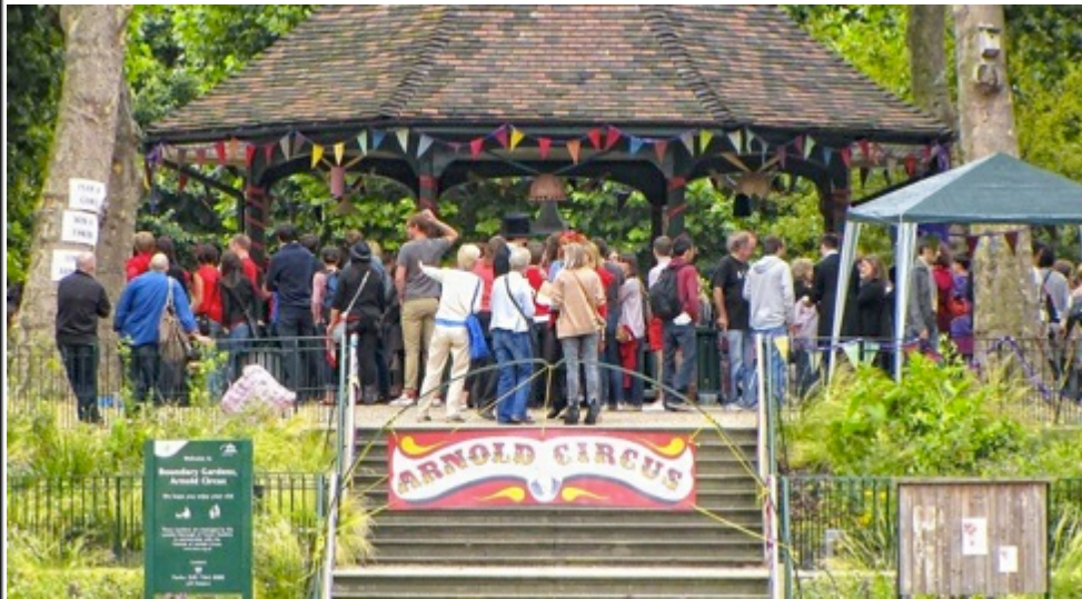
Running away with the Circus