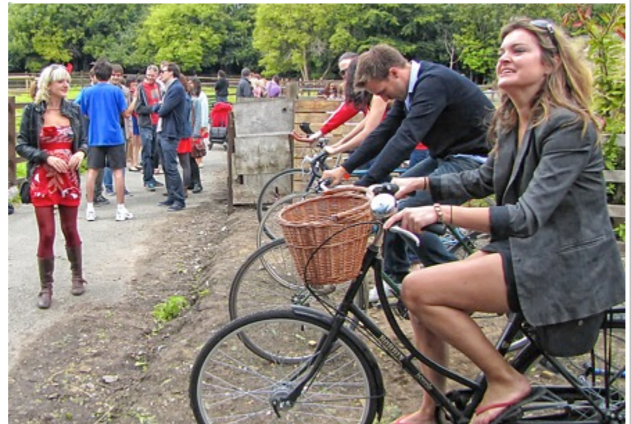
Cycling to power the projection of a clue