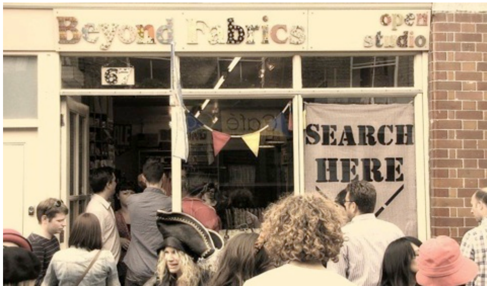
Exploring fabric shops