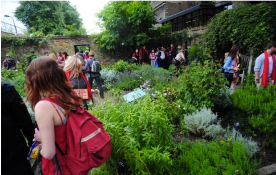
Searching hidden gardens