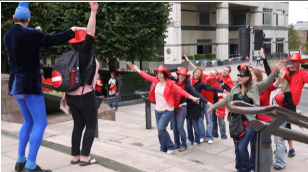
Joining the Kazzoo Orchestra